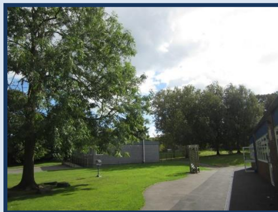
The whole school is set in well-maintained grounds and is surrounded by beautiful countryside.

Outside we have a large school field, two large playgrounds, a climbing frame, outside gym equipment, a climbing wall, a “quiet area”, a willow tunnel, an outdoor library, a wild area, a children’s garden and an enclosed environmental area.